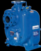
Super U Series® Self-Priming