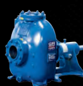
80 Series® Self-Priming