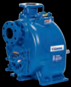
Super T Series® Self-Priming