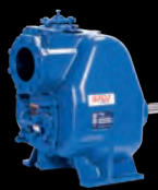
Ultra V Series® Self-Priming