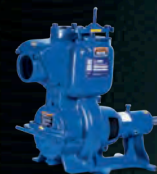
10 Series® Self-Priming