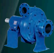
6500 Series® Standard Horizontal End Suction